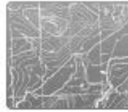
20K HISTORIC BASE