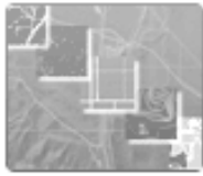
20K BASE FEATURES