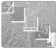
20K BASE FEATURES