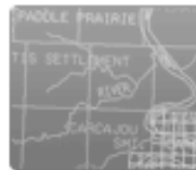
SMALL SCALE TOPOGRAPHIC